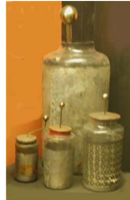
Figure 1. Leyden jars at the Smithsonian Museum, Washington, D.C.

The first electrical storage device, the Leyden Jar was invented by Ewald Georg von Kleist of Pomerania (now a part of Germany) in 1745 and independently by Pieter van Musschenbroek of the University of Leyden, Holland in 1746. This device, actually a capacitor, allowed scientists to store static electrical charges and transport them to different locations. The actual explanation of how it worked was provided by Benjamin Franklin in 1747.