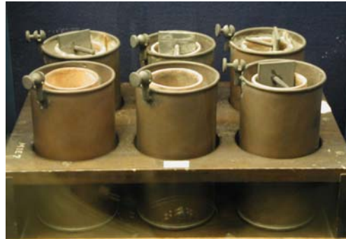
Figure 3. Electrochemical cells at the Smithsonian Museum, Washington, D.C.

In 1859 Raymond Gaston Planté invented the lead-acid battery. Using two thin lead plates separated by rubber sheets immersed in a dilute sulfuric acid solution, he was