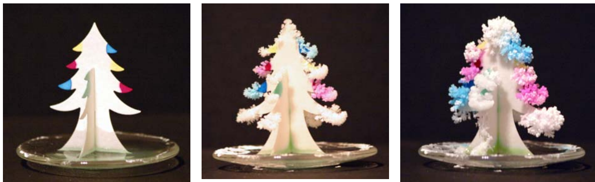
Figure 3. The Magic ® Tree showing three stages of crystal growth.

As an alternative, the representative solution using sodium chloride, ammonia, water, and laundry bluing can be used to grow crystals on a home-made "tree", a charcoal briquette, or a porous material such as lava rock (such as used in a gas barbecue). To give the crystals some color, drops of food colors can be placed on the growing material and allowed to dry before use.