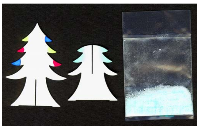
Figure 2. The components of the Magic ® Tree