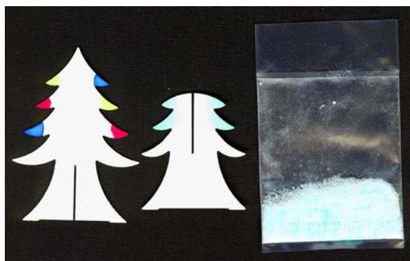
Figure 1. The components of the Magic ® Tree